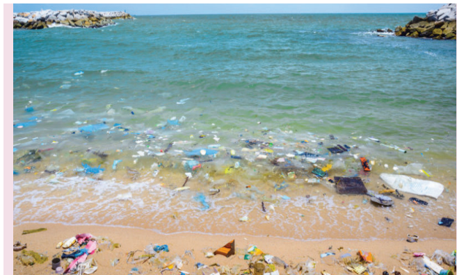
Don't throw rubbish into the sea

We have learnt that God created the world, pronounced it to be good and entrusted its care to human beings. How are you taking care of God's earth? What are you doing and what can you do to make the world a cleaner and healthier place?