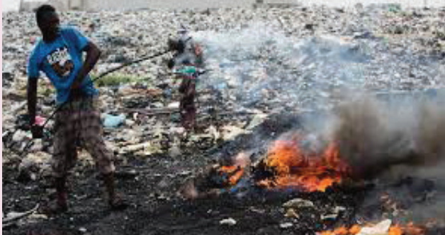
Filth is a major hazard