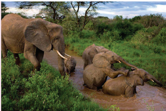
Elephants crossing a stream