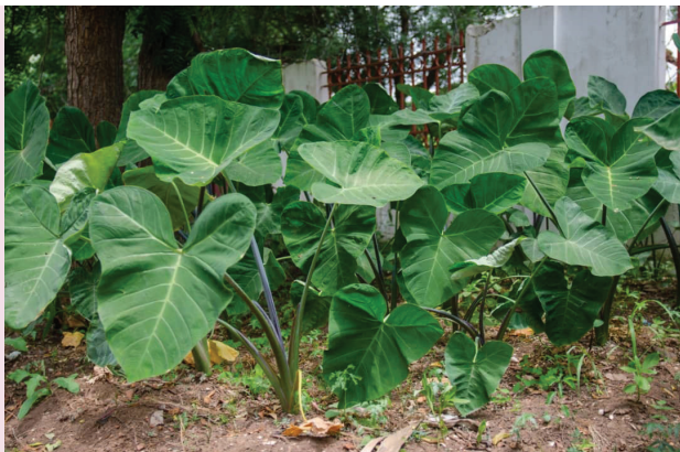
Soil from compost is used to grow cocoyam. The leaves give us "Kontomire"