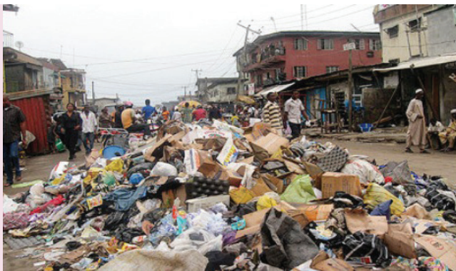
Improper handling of refuse destroys the environment and harms human health