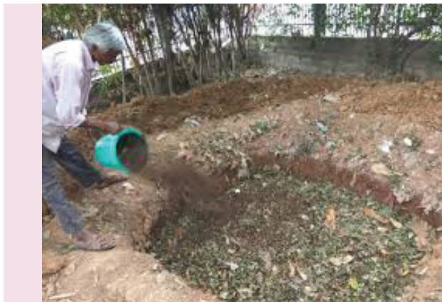
A Compost Pit

So, what should you do? Separate your waste! Make compost pits!